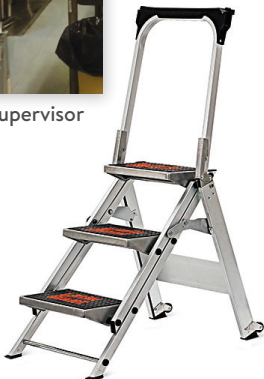
3-Step Little Jumbo Step Ladder 55074100