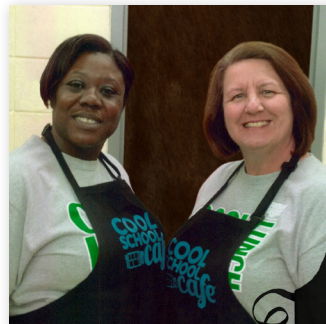
Terrebonne Parish School District, LA