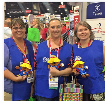
School Nutrition Association National Conference Registration (ANC) 30082316