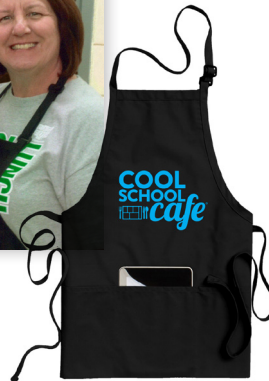
Cool School Cafe Apron 30082453